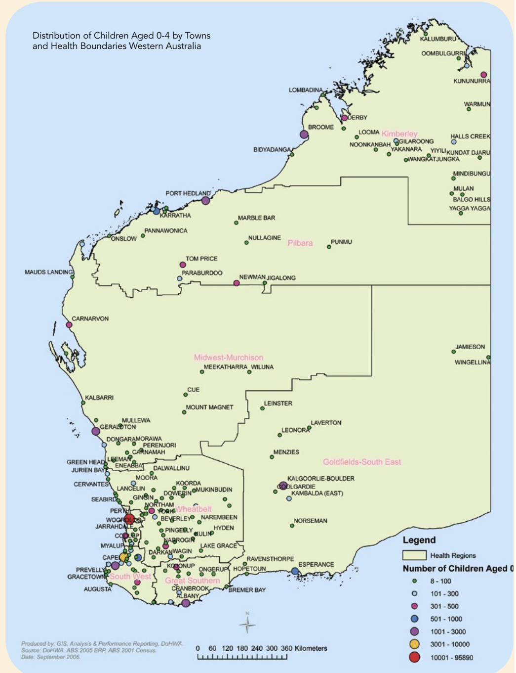
Distribution of Children Aged 0-4 by Towns and Health Boundaries Western Australia

Overall, the population data suggests that on a range of indicators, children and youth in the SWHR appear to mirror their counterparts across the State as a whole.