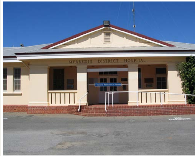
Merredin District Hospital's art deco façade.

“But things change; there are now better and safer