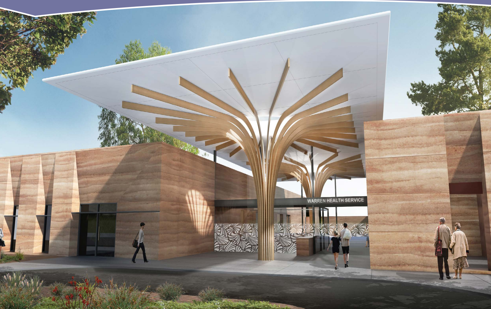
Artist's impression of the new Warren Health Service.