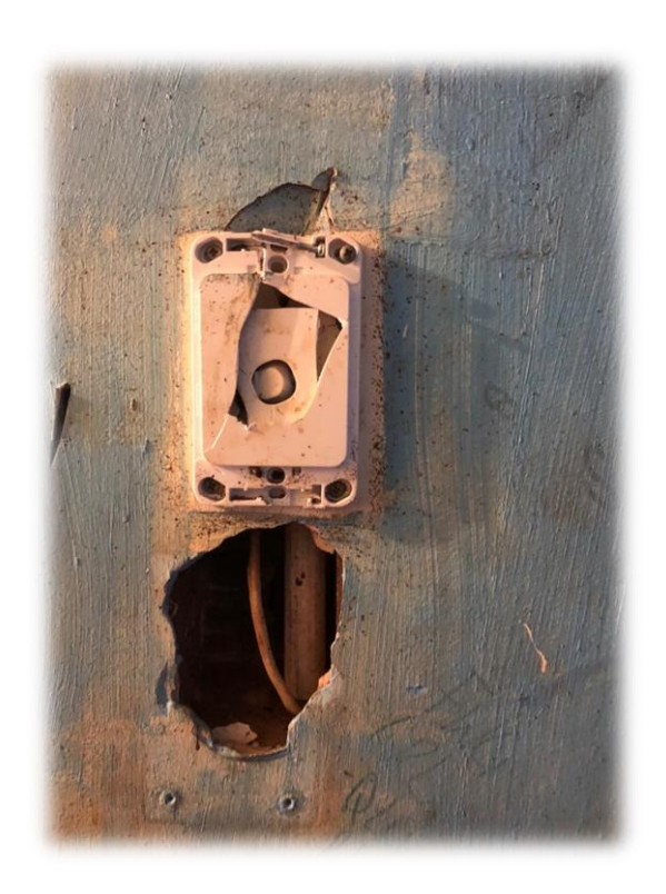
What is the chance of hot water in the house below?

Is the condition of the light switch in the following photo dangerous? Whom do you inform? How soon will it be fixed? The obvious answer is it's very dangerous and is a priority. This is not unusual as AEH practitioners are confronted with similar experiences from time to time. Housing has informed us that they are very keen that any instances of poorly maintained housing are reported on its telephone Hotline. Further information on how to do this available from EHD.