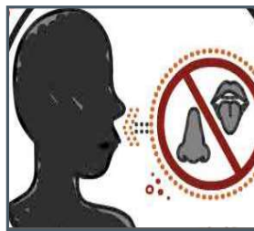
No smell/no taste