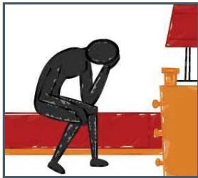
Just feeling sick

If you feel sick or have any symptoms get tested. Call your local health worker at the clinic.