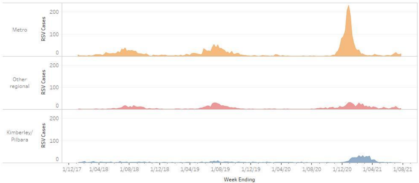
Figure 2: Hospital attending paediatric patients with RSV in Perth metropolitan region, in both Kimberley and Pilbara combined and in the remaining regions combined.

Of the 16 paediatric cases of RSV this week, 12 were from the Metro area, three from the Southwest and one from the Goldfields.